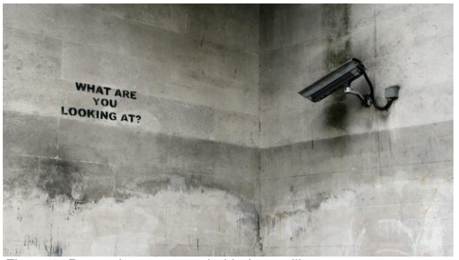
Figure 2. Reasoning purposes behind surveillance

LFR enables real-time location tracking and behavior policing of an entire population. The scale of implementation is ultimately in the direction of omnipresence. The banalization of surveillance can create a chilling effect that leads to the naturalization of further constraints to individual and public liberties, hampering autonomy by hindering choice and uncoerced decisions and undermining basilar democratic practices linked to fundamental rights, such as freedom of association and expression.